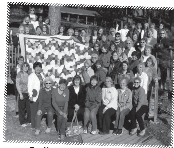
Outlaw Ranch, Custer SD

April 29 April 30-May 2 and/or May 7-9, 2010